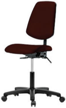
Shown in Burgundy