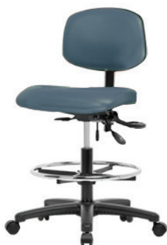
Shown in Blue