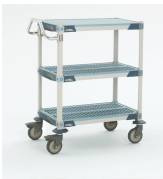
Three Shelf Model