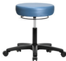
Shown in Blue